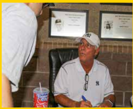
Former Yankees star Bucky Dent with a fan at a sponsored autograph and photo session.